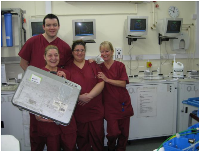
RLBUHT Gastroenterology Unit staff with donated equipment ready for Malawi