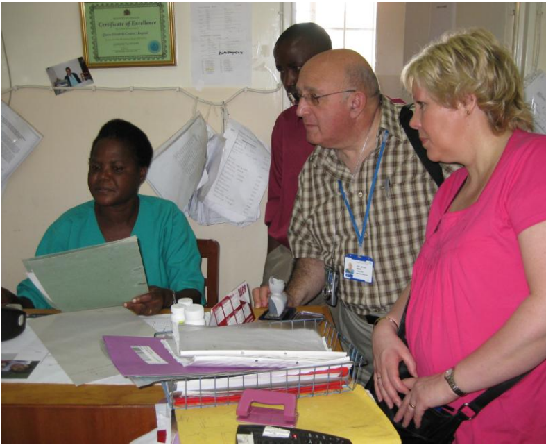
Visiting the anti-retroviral treatment clinic for AIDS patients