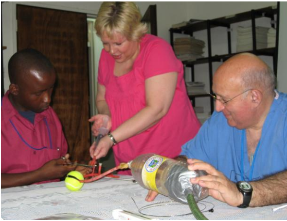
Teaching insertion of a Minnesota tube using a locally-made model (a coke bottle!)