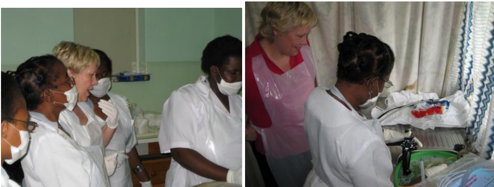
Sr Ireland working with nursing staff on equipment decontamination and patient-related nursing processes